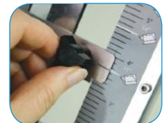
Clearly marked fold plates for quick and easy setup

The FD 314 Office Desktop Folder provides user-friendly controls in a rugged, compact unit. Clearly-marked fold settings and push-button operation make it easy to use, right out of the box. It's capable of folding 11" and 14" paper at speeds up to 7,700 sheets per hour, with a hopper capacity of up to 250 sheets.