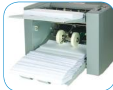
Output conveyor for neat & sequential stacking