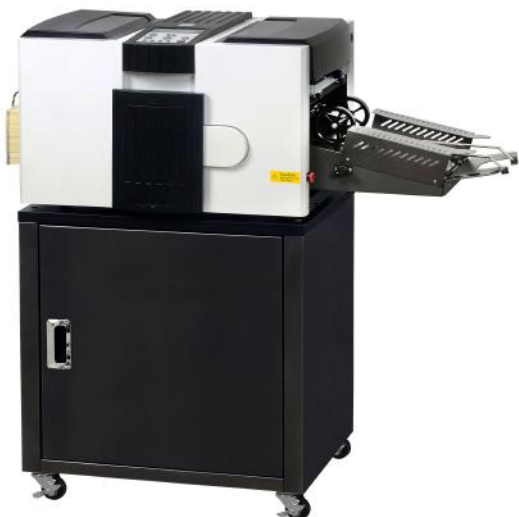
Shown With Optional Short Conveyor And Cabinet

the best value tabletop pressure seal in the market