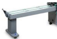
Optional 50" Conveyor

Large Capacity Elevator Infeed Table Holds Up To 700 28# Pressure Seal Forms