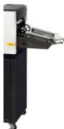
Optional Short Conveyor

no envelope needed seals single-sheet self mailers a greener way to mail®