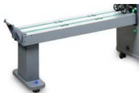
Optional 50" Conveyor

Large Capacity Elevator Infeed Table Holds Up To 700 28# Pressure Seal Forms