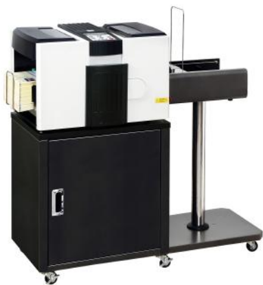
Shown With Optional Cabinet And Vertical Stacker

the most advanced desktop pressure sealer