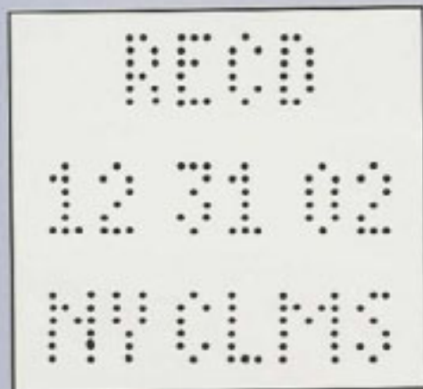
700-5 800-5 Narrow die, Date with optional top and bottom line.

Model 700-1 and 800-1 can be provided for permanent marking of the date on x-rays. Model 700DN has date and numbers. Automatic trip or push button options are available on the electric models.